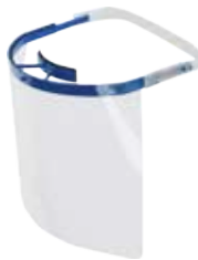
LF Code: 3716010 GEV Code: 802512

body range 32-42.9°C (89.6°-109.2°F) accuracy ±0,2°C - ±0.4°F measuring distance 1-15cm ambient operating temperature -25/+55°C automatic shutdown after 5 sec power supply DC 3V - 2 batteries R03 AAA 1.5V (not included) dimesions 95x60x180 mm - weight 146 g