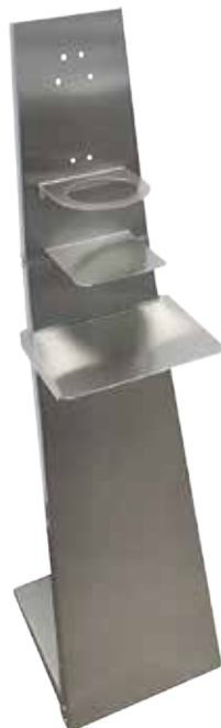
LF Code: 3716012 GEV Code: LF3716012

100% AISI 304 stainless steel Solid, free-standing structure h 100 cm Support for dispenser - Max diameter 100 mm (dispenser not included) 2x dispenser-fastening bands Shelf for gloves, tissues or masks All elements can be removed for easy cleaning and sanitising