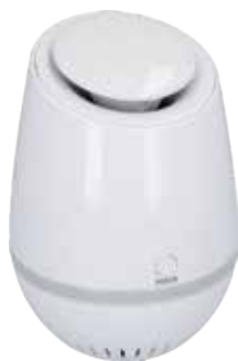
LF Code: 3610036 GEV Code: LF3610036

Voltage DC 6V / 4 batteries D (not included) Ozone production 12 mg/h For refrigerators up to 700 L Dimensions 133x73h140 mm Kills bacteria and viruses Prevents the growth of mold Eliminates pesticide and herbicide residue and stale odours, reduces food decay