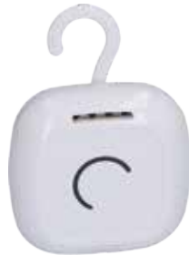
LF Code: 3010284 GEV Code: 802231