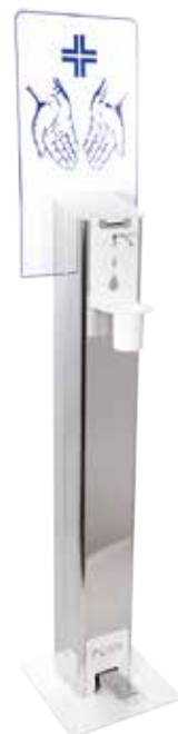
LF Code: 3716015 GEV Code: LF3716015

Made entirely of stainless steel Ready for dispenser application both manual and touch Dimensions 300 x 330 x H 1190 mm