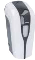
LF Code: 3092366 GEV Code: LF3092366

stainless steel AISI 304 - capacity 700 ml power supply with 6 DC 9V/AA batteries (not included) - low battery indicator sensing distance 5/9 cm dosage adjustable from 0.5 - 2.5 ml dimensions 100x110x220 mm