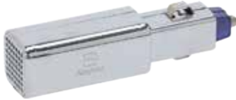
LF Code: 3610022 GEV Code: LF3610022