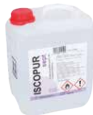
LF Code: 3092373 GEV Code: 802275

alcohol-based sanitizing detergent denatured (ALCOHOL MIN. 65% VOL) use without water