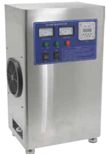
LF Code: 3610050 GEV Code: LF3610050