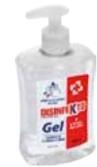
LF Code: 3092368 GEV Code: LF3092368

alcohol-based sanitizing detergent denatured (ALCOHOL MIN. 65% VOL) use without water - with flip top cap