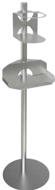
LF Code: 3716011 GEV Code: LF3716011

Compressed air Professional equipment for nebulising detergents and disinfectants Rilsan spiral hose 7.5 m