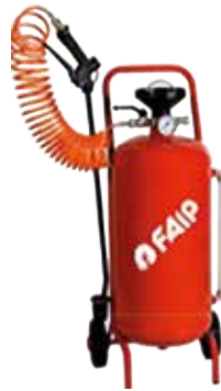
LF Code: 3070410 GEV Code: LF3070410

230/240V - 50HZ - 650W tank capacity 800 ml - hose length 1.5 m weight 1900 g includes: 5L sanitising fluid, main unit, hose, carrying belt, viscosity measuring glass, spray gun, tank, cleaning clip