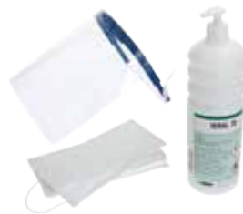
LF Code: 3091061 GEV Code: 802513

Thickness 0.25 mm - dimensions 260x210 mm Tested, approved materials Easy, practical disinfection To prevent the formation of visible stains Wash with water after sanitising