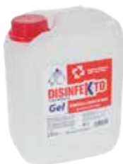
LF Code: 3092370 GEV Code: LF3092370

alcohol-based sanitizing detergent denatured (ALCOHOL MIN. 65% VOL) use without water - with dispenser cap