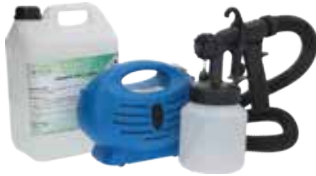
LF Code: 3096001 GEV Code: LF3096001