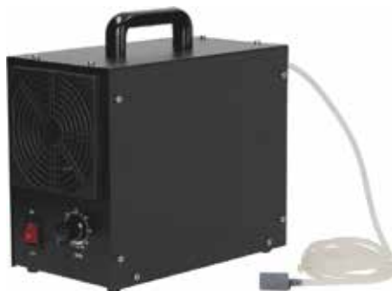
LF Code: 3010059 GEV Code: LF3010059