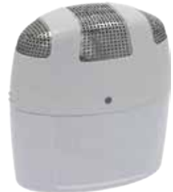
LF Code: 3010134 GEV Code: LF3010134