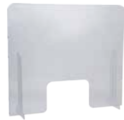
LF Code: 3091060 GEV Code: LF3091060

The kit includes: 3091048 Washable double layer mask (5 pcs) 3716010 Face visor 3092360 Hand cleaner gel IDRAL70 (1 L)